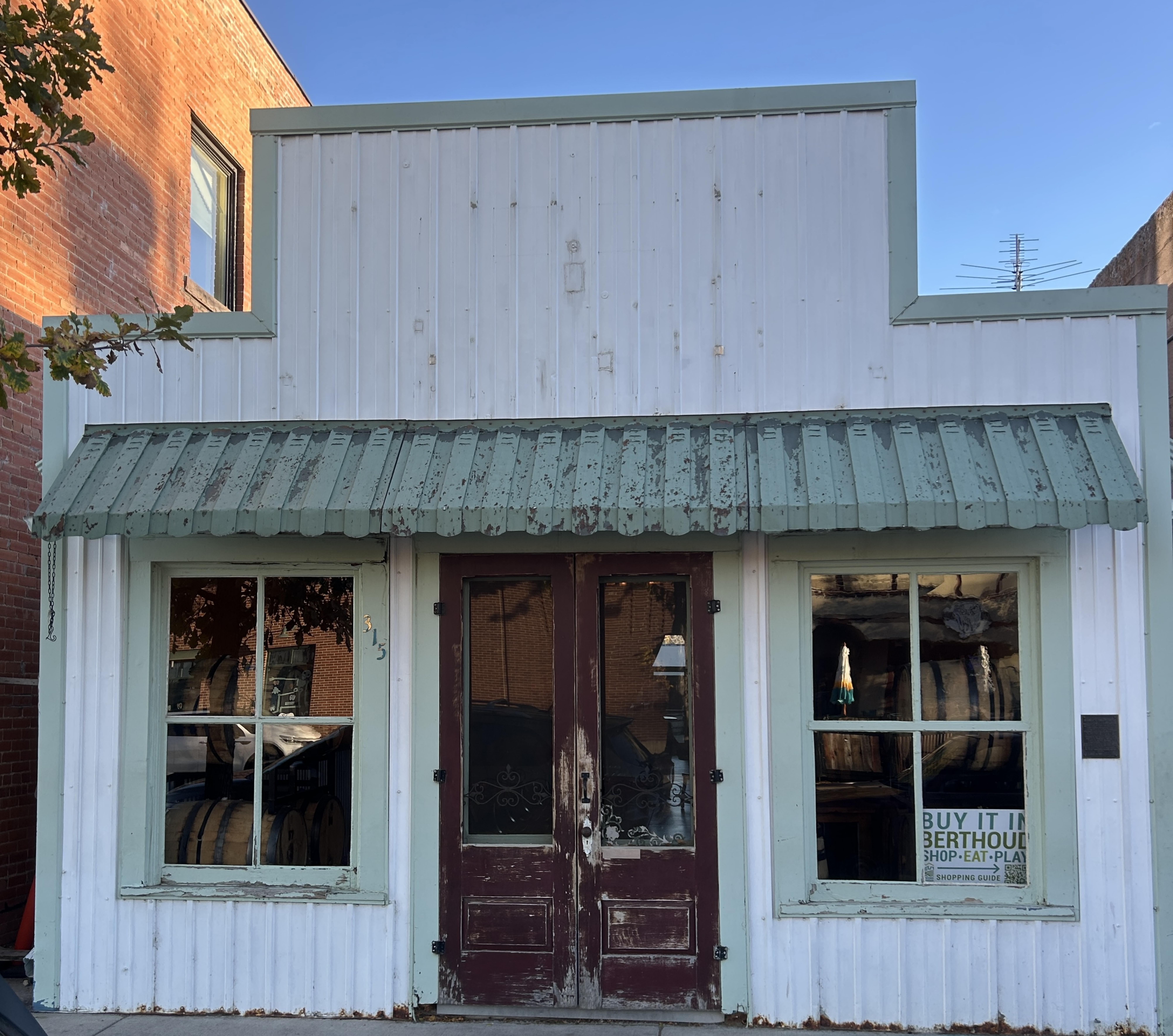
10-20-25 photo taken facing south